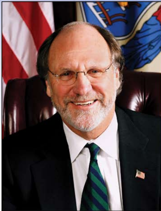
Governor Jon Corzine